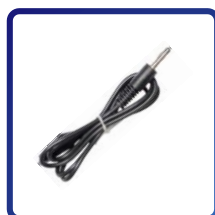
Grounding Cable x 1