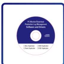
PC Link Software Disc x 1