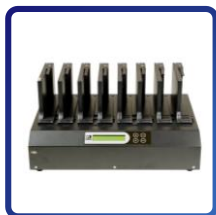
Duplicator x 1