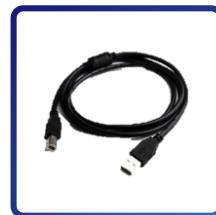
USB Cable for PC Link x 1