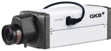
Detect Flame & Smoke Onvif Box Camera