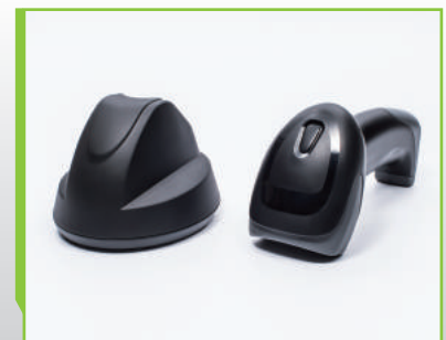
Replacable Tip for Easy Maintenance