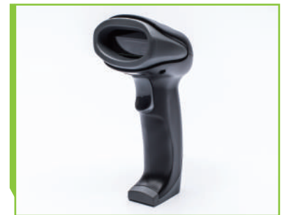
Rugged Wand-Type Metal Housing

The BC-6500BT has a secure range of up to 90 meters and an aggressive and robust linear imager that scans 270 times per second. BC-6500BT's high performance, ergonomic design combines simple reliability with the flexibility and convenience of a wireless scanner. This highly reliable scanner is for daily retail industry and office environment.