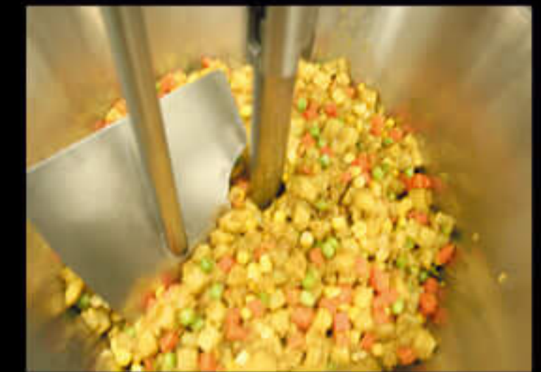
Chunk and Dice Filling