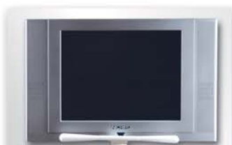
▲ LCD TV/MONITOR 1. JAPAN MADE 2. HIGH BRIGHT, HIGH DEFINITION