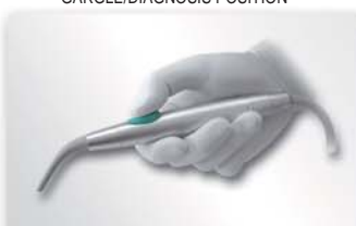
▲ 3-WAY SYRINGE ITALY MADE, AUTOCLAVABLE