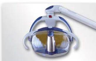
▲ DENTAL LIGHT 1. ITALY MADE, WITH LUMINESCENCE BULB 2. AUTOMATICALLY OFF/ON WHEN CHAIR IN GARGLE/DIAGNOSIS POSITION