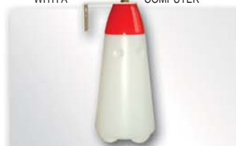
▲ 2000cc DISTILLED WATER BOTTLE