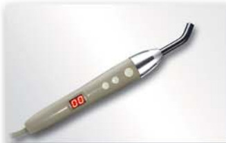
▲ LED CURING LIGHT FASHION APPEARANCE, MORE CONVENIENT TO USE

MATERIAL : SPECIAL MEDICAL METEIRAL APPLY TO : AIR STORAGE FOR MEDICAL USE