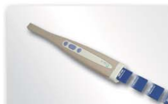
▲ INTRA-ORAL CAMERA WITH BUILT-IN SD CARD (128MB) WHICH CAN SAVE MORE THAN 200 PICTURES WITHOUT WORKING WITH A COMPUTER