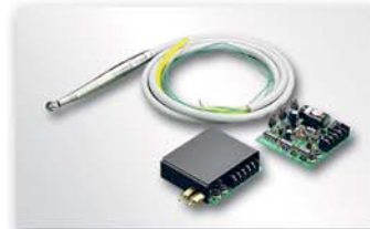
▲ FIBER OPTIC SYSTEM ONE CONTROL BOX CAN USE WITH TWO FIBER OPTICAL HP.