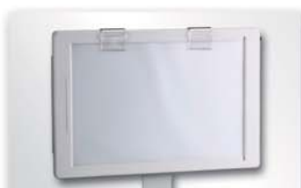
▲ PANORAMIC X-RAY FILM VIEWER IT CAN BE USED FOR INSPECTING PANO AND CEPH (THE VIEWER CAN BE TURNED 90 DEGREE.)